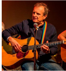
Listening, Laughing and Leading

Come learn about Collaborative Response, an organizational mindset that involves some fundamental shifts for schools and districts and the good news is that some likely already exist in your building!